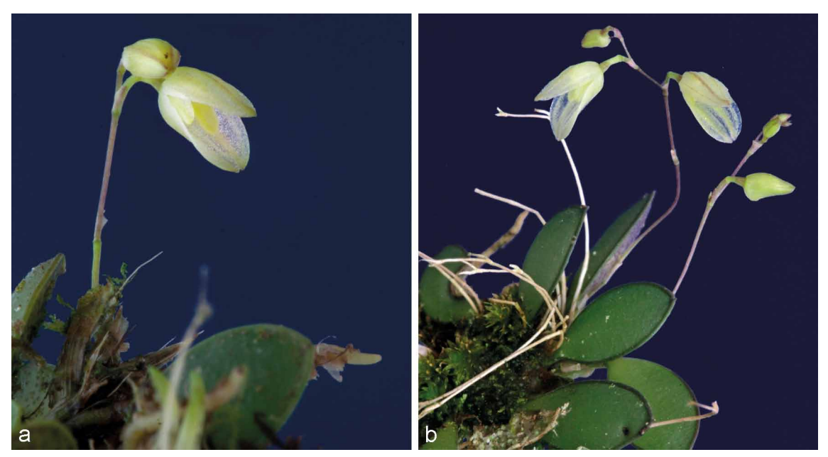
Fig. 2 Specklinia lugduno-batavae Karremans, Bogarín & Gravend. a. Close-up on a flower; b. showing the habit (a. Pupulin 7709; b. Bogarín 6761, both JBL-spirit) — Photos by: a. A.P. Karremans; b. D. Bogarín.