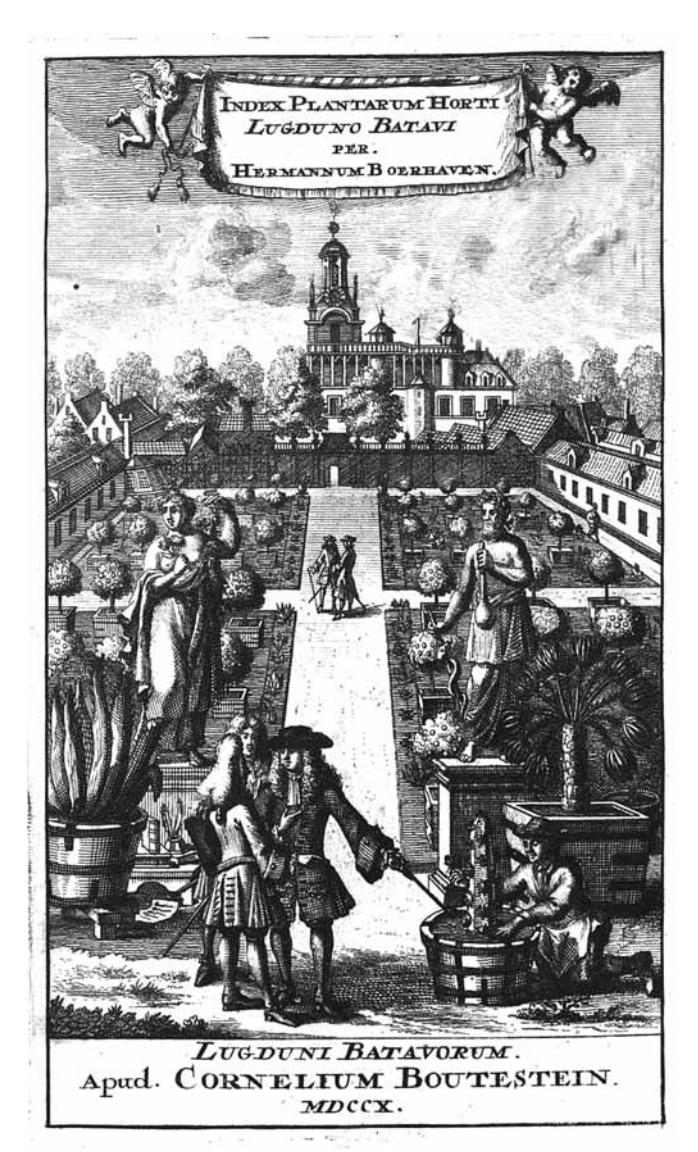
Fig. 5 Hortus Academicus Lugduno-Batavus as depicted in Boerhaave (1710).

Note — The short plant up to 1 cm tall, the suborbicular leaf with purple spots on the abaxial surface, the flexuous, successive racemose inflorescence with a single flower open at a time, the conspicuous thickening of the apex of the dorsal sepal, and the ligulate, unlobed, mostly inornate lip, which is shallowly depressed longitudinally in the middle places Specklinia lugduno-batavae in the S. digitalis species group (Fig. 3). The few tiny flowers and short inflorescence are similar to that of S. pisinna (Fig. 4), a species known to occur in Mexico, Guatemala and Honduras. However, the new species can be distinguished by the prostrate habit (vs erect habit), with shorter leaves, up to 8 mm long (vs 11 mm), the flexuous inflorescence containing up to 6 flowers (vs straight, containing up to 3 flowers), the creamy-white flowers (vs heavily suffused and striped with purple) and the shorter lip (up to 1.6 vs 2.3 mm). From the Mexican endemic S. digitalis, it can be distinguished by the smaller prostrate habit with shorter leaves, 4-8 mm long (vs 12-15 mm) and shorter inflorescence (up to 2 vs 15 cm long) the ligulate to narrowly elliptic petals (vs obovate). Specklinia succulenta from French Guyana is also similar, but the new species can be distinguished by the prostrate habit (vs erect), the short inflorescence (up to 2 vs 10 cm long), the whitish cream flowers (vs greenish yellow) and the immaculate lip (vs a lip with two purple stripes).